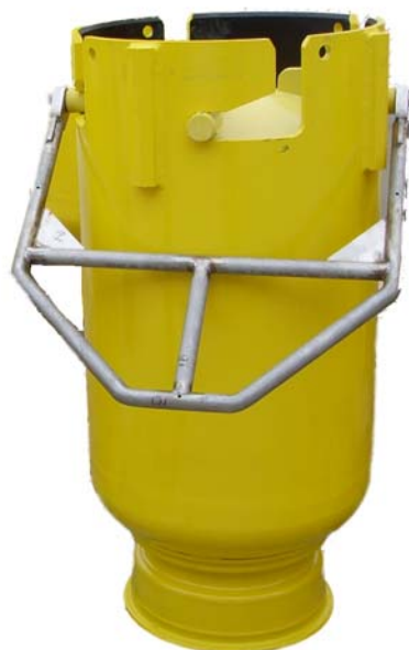
22.5" Suction Pile Receptacle with 22.5" Suction Pile Plug Fitted